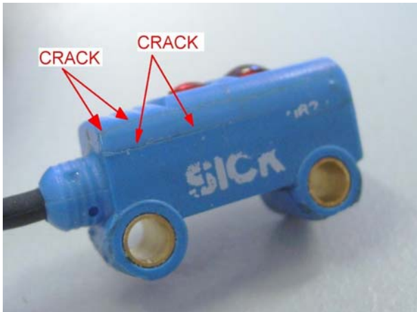
Cracks occurring along the corner edges of sensor

Below are typical examples of what cracks look like and where they occur.